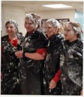
Pie a Teacher