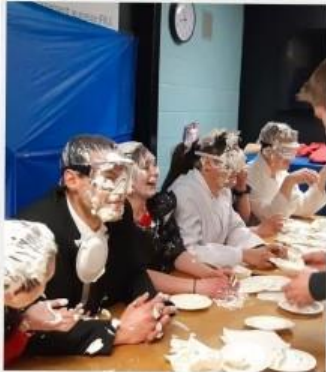
Pie a Grad