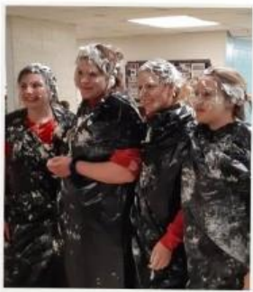
Pie a Teacher